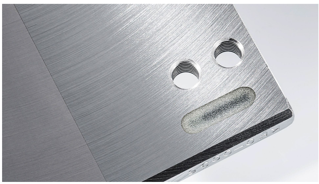
Small, but important: The RFID-Chip is the centerpiece of IntelliKnife